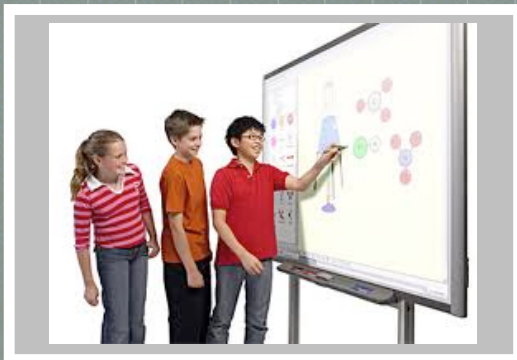
Example of students collaborating while using a Smartboard in a collaborating learning environment.

Differentiated Instruction – which is a teaching theory based on the idea that instruction approaches should give students multiple options for taking in information, making sense of ideas, expressing what they learn, and accommodation differences while teaching to students strengths and knowledge.